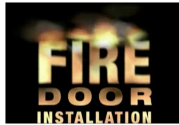
Online Educational Videos