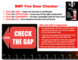
Gap checkers for Installers